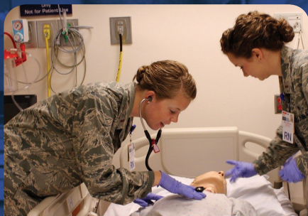
AIR FORCE NURSE RESIDENTS IN ACTION!

The purpose of the Air Force Nurse Residency Program is to provide newly graduated nurse accessions with a collection of deliberate training experiences and opportunities selected to establish a culture of ongoing professional nurse officer development. The program meets the National Council of State Boards of Nursing Transition to Practice model.