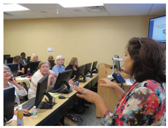
Summer Institute 2014

This year's sessions will be held via videoconferencing and the Rutgers Canvas Learning Platform. You will gain hands-on instruction and practice in using the JBI specialized software program called SUMARI (the System for the Unified Management, Assessment and Review of Information), which is designed to assist researchers and practitioners to conduct systematic reviews of 10 different types, including reviews of effectiveness, qualitative research, economic evaluations, prevalence/incidence, aetiology/risk, mixed methods, umbrella/overviews, text/opinion, diagnostic test accuracy and scoping reviews. More information on this comprehensive tool is available at jbisumari.org