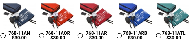
○ 768-11AN $30.00 ○ 768-11AOR $30.00 ○ 768-11AR $30.00 ○ 768-11ARB $30.00 ○ 768-11ATL $30.00