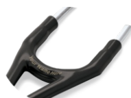
Full Name on Tubing ○ FREE