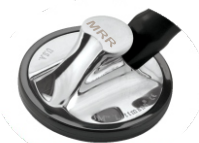
3 Initials on Chestpiece ○ $5.00

Redding Medical offers laser engraving on all Littmann stethoscopes. The laser marking is permanent and can help deter thieves.