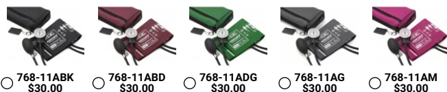
○ 768-11ABK $30.00 ○ 768-11ABD $30.00 ○ 768-11ADG $30.00 ○ 768-11AG $30.00 ○ 768-11AM $30.00