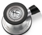
Full Name on Chestpiece ○ $10.00