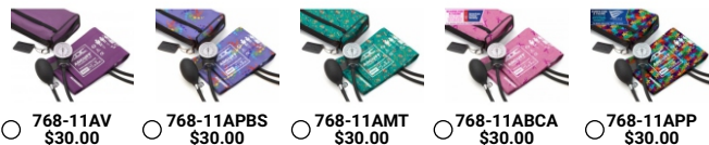
○ 768-11AV $30.00 ○ 768-11APBS $30.00 ○ 768-11AMT $30.00 ○ 768-11ABCA $30.00 ○ 768-11APP $30.00