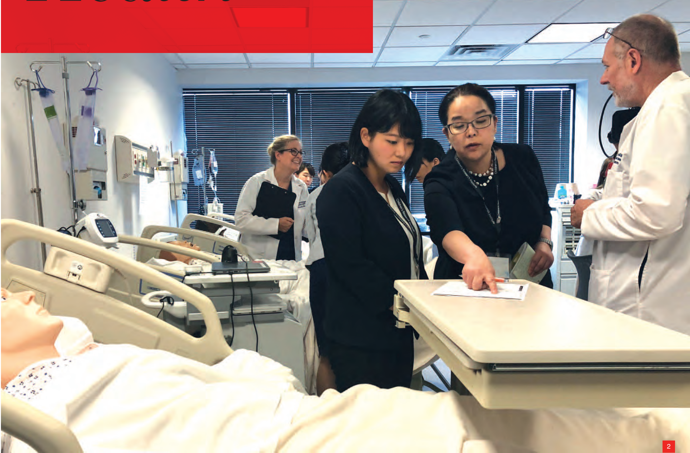
PHOTO 1: Nursing students from the TOMODACHI Initiative begin the hands-on component of their disaster nursing training at Rutgers nursing. With help from Robert Wood Johnson (RWJ) University Hospital staff, the students navigate the fast-paced environment of an emergency room at a global trauma simulation.